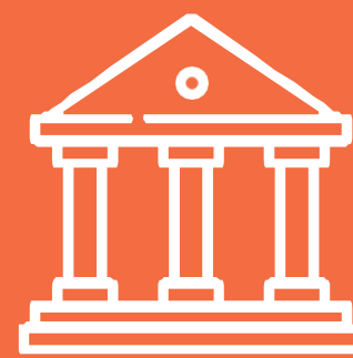
NGO & Govt