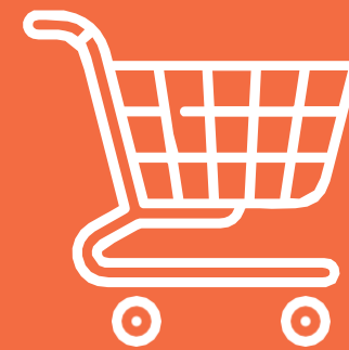
Retail & SMEs